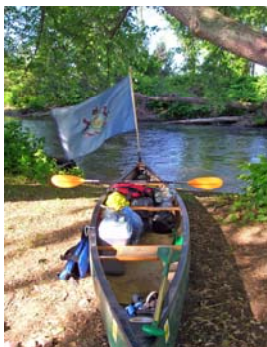
The Governor's Yacht Stops at Island 83a

The Brooklyn Bridge would be too big for the job, so Cumberland County received a grant to consider purchase of a surplus bridge from PennDOT to provide a pedestrian river crossing between Wormleysburg and Harrisburg's City Island. It would replace the spans of the former Walnut St. bridge that were swept away by an ice dam breakage in the '90s.