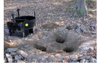
Fire Ring Ready for Installation

Only Islands 81a, 82 and 101 remain in need of permanent rings – which are on order. However, Island 101 is under consideration for relocation to a nearby, more spacious island. A ring is being ordered in anticipation of establishing a new campsite to replace 103. This latter island is no longer in use as a result of the removal (i.e. vandalism) of a key tree at the head of the island. Without that protection, the spring river levels are washing away the island!