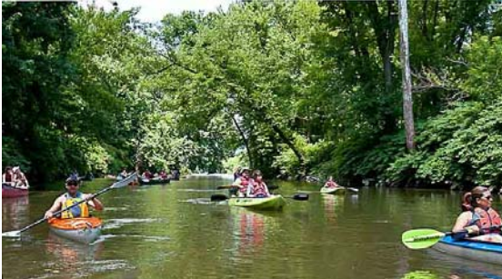
Island Hoppers Hopping Between Islands

A sunny, warm Saturday, June 27 and a full river saw 119 kayakers and canoeists enjoying a happy adventure on the Susquehanna River between Fort Hunter Park and City Island, Harrisburg. SRTA, joined by the Canoe Club of Greater Harrisburg (CCGH)